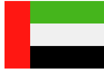
VEHICLE: JAWS ARMORED PERSONNEL CARRIER (APC) 4X4 COMPANY: INTERNATIONAL ARMORED GROUP COUNTRY: UNITED ARAB EMIRATES